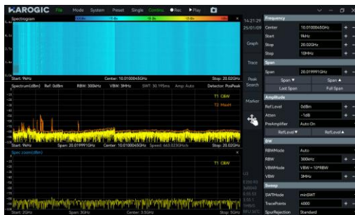
Standard spectrum sweep