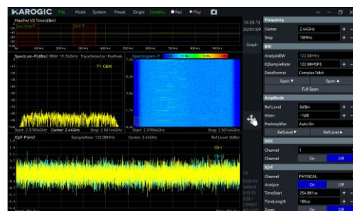
IQ streaming and analysis